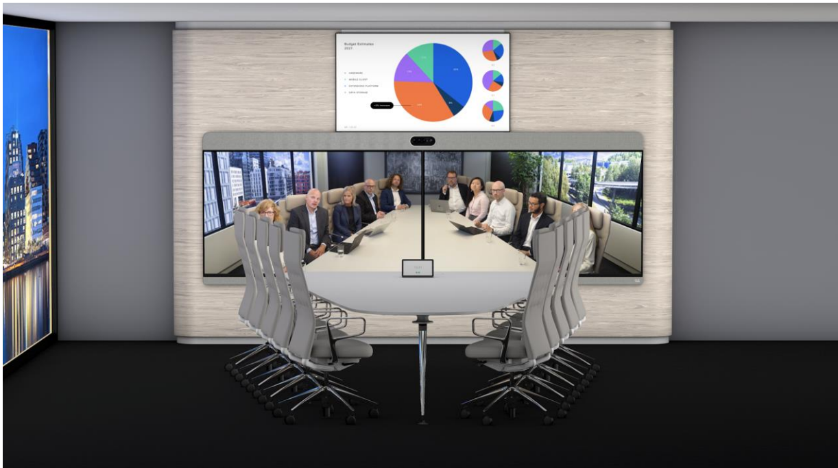
Figure 2. Cisco Webex Room Panorama in a large conference room