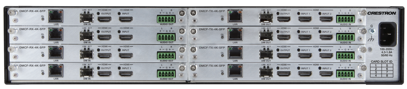
DMF-CI-8 — Rear View with Cards Installed