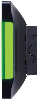
TSS-752-B-S - Side View with optional Multi-Surface Mounting Kit (sold separately)

Crestron Fusion Cloud supports the use of room occupancy sensors to detect when no one has shown up for a scheduled meeting. In such an event, the current reservation can be cancelled automatically to make the room available to others. Occupancy sensors do not connect directly to the TSS-752. They communicate with Crestron Fusion Cloud via a connection to a Crestron control system . Crestron GLS Series Occupancy Sensors [4] are available in a variety of types to support a connection to the control system using Cresnet®, infiNET EX®, or a Versiport I/O port.