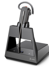
Voyager 4245 Office