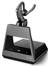
Voyager 5200 Office UC Series

The Poly Blackwire family gives you a broad selection of corded UC devices that deliver outstanding audio quality and reliability, ease of use and price points to meet any budget.