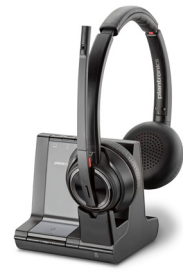
Savi 8200 Office UC Series