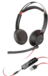
Blackwire 5200 Series