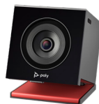
EagleEye Cube USB