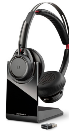
Voyager Focus UC