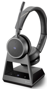
Voyager 4200 Office UC Series