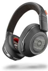
Voyager 8200 UC